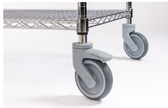
Shows mobile unit