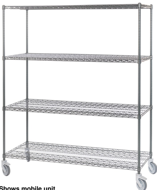
Shows mobile unit